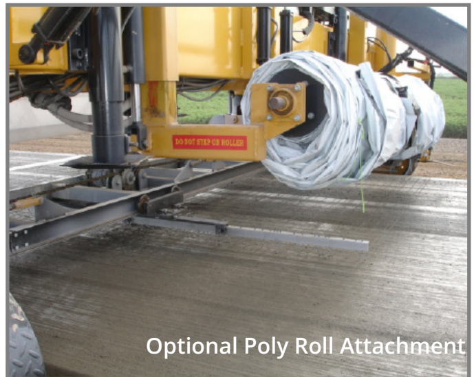
Optional Poly Roll Attachment