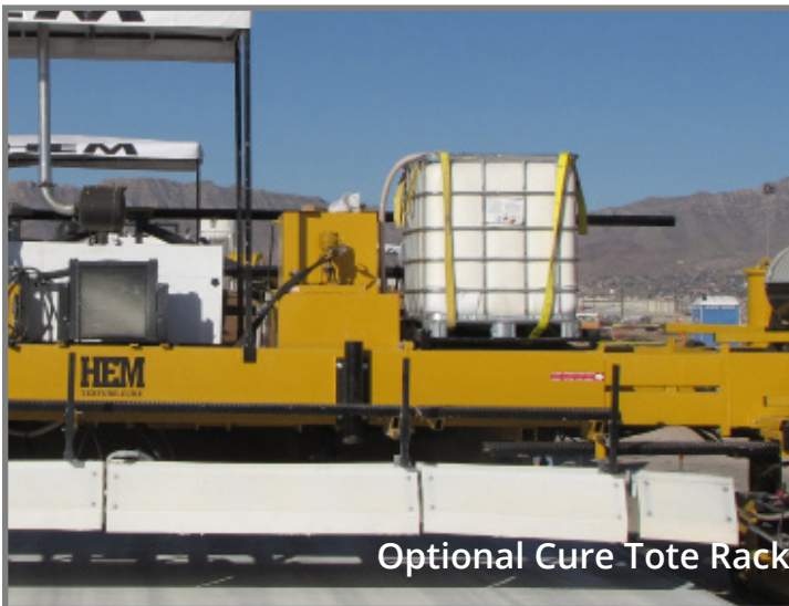
Optional Cure Tote Rack