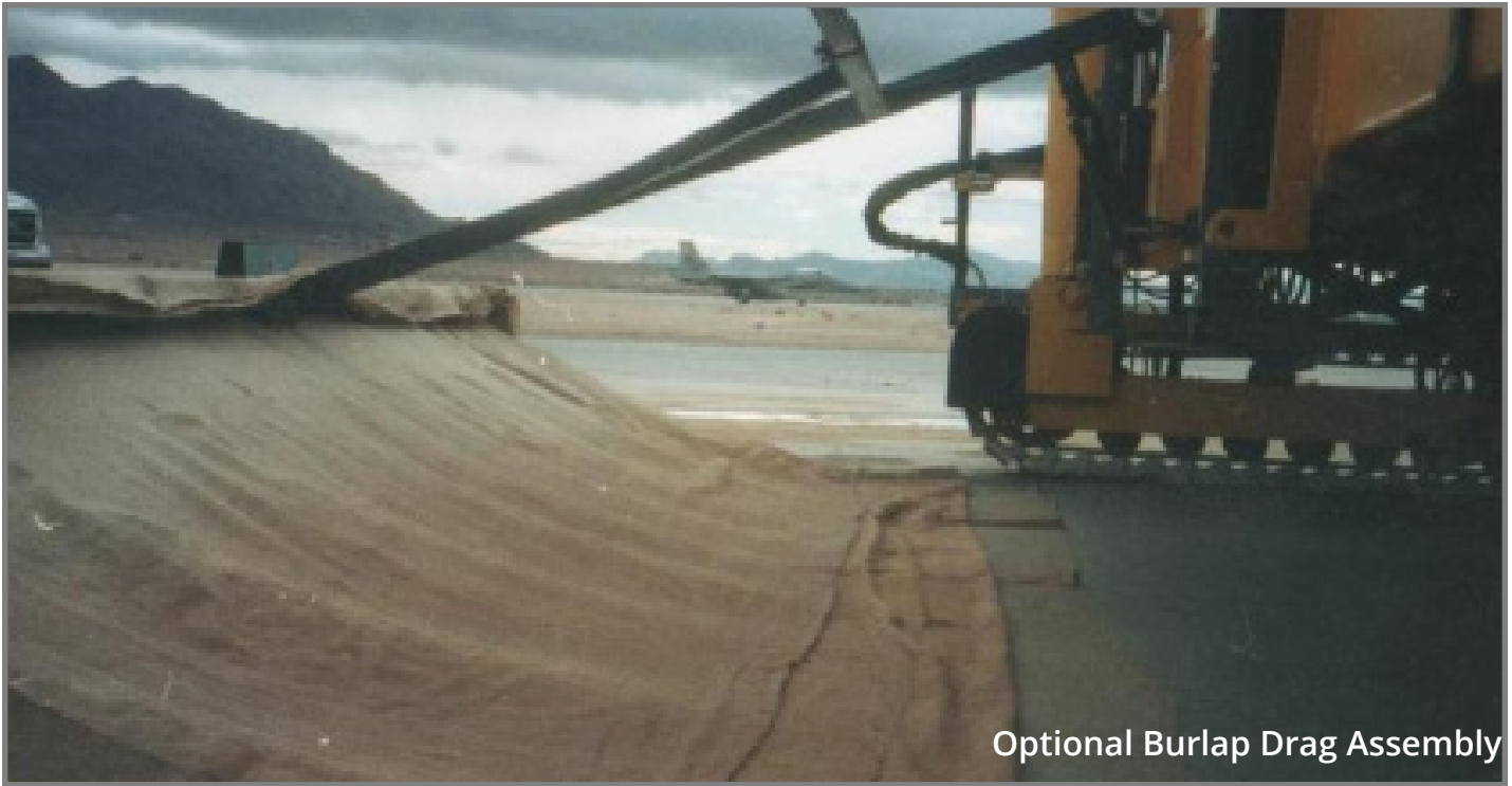
Optional Burlap Drag Assembly